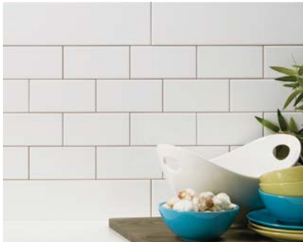
Core White Glossy 3"x6", 4"x16"